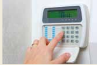
All units are equipped with an alarm system

Security alarm complete with system installation.